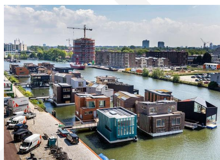
Schoon Schip neighborhood

The last part of the workshops was the technical tour during which participants visited a 2.2 MW solar park close to Utrecht. The 500 kWp distributed PV systems in the district of Nieuwland, Amersfoort was the first city scale PV pilot in the Netherlands built 20 years ago, followed by a visit to a sustainable floating neighborhood “Schoon Schip” in Amsterdam, a development of 47 houseboats, 100 residents, which aims to realize 100% renewable heat and hot water supply and 100% renewable electricity.