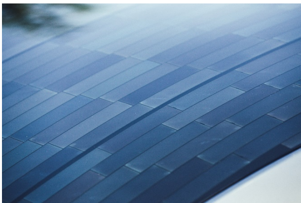
Integrated PV in car roof, courtesy of Lightyear.

Bonna Newman, PhD TNO Energy Transition, Solar Energy Westerduinweg 3 1755 LE Petten The Netherlands Email: bonna.newman@tno.nl Website: http://www.tno.nl