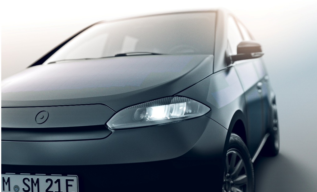
Sono Motors' Sion front close-up, 2021