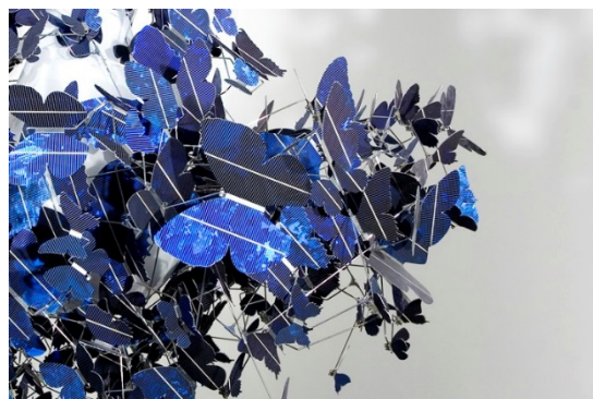
Solar powered chandelier, Virtue of Blue, DeMakersVan, The Netherlands, 2010