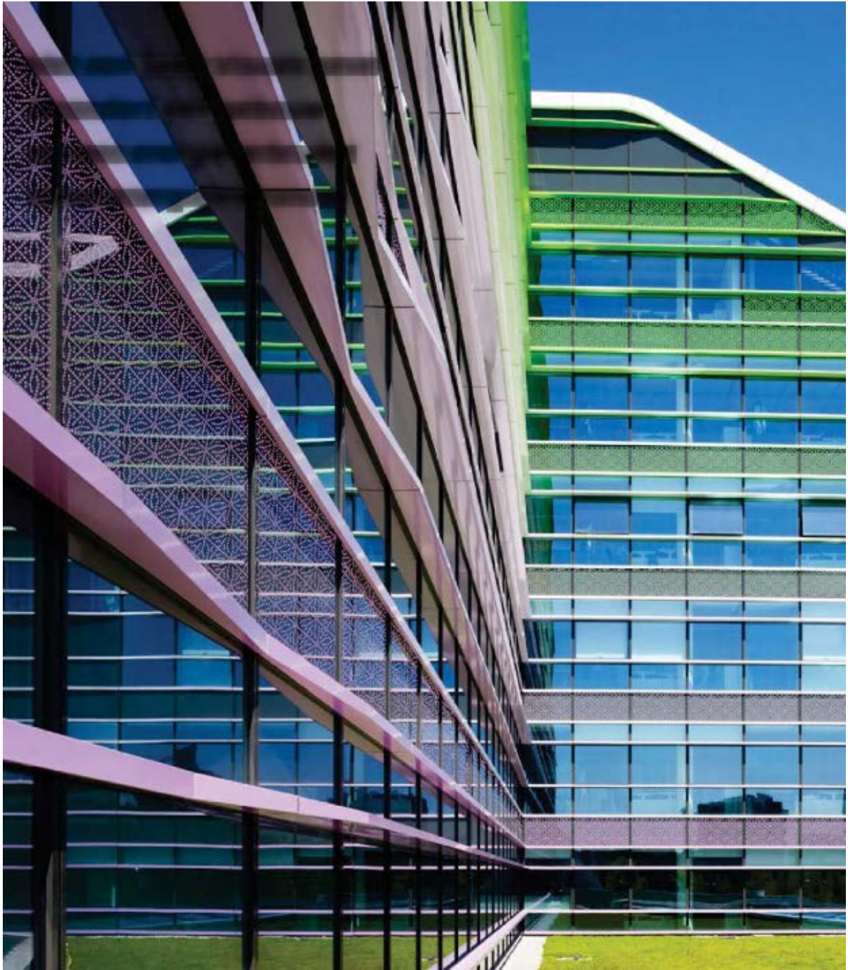
UNStudio Office retrofit design, colored PV in spandrel panels of a curtain wall