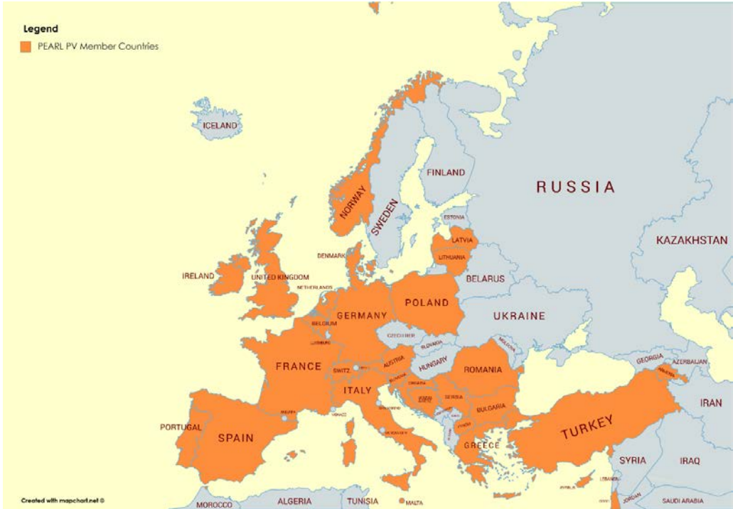
Figure 2: Countries involved in COST Action PEARL-PV by September 2018 in orange.

At present, 1 st of October 2018, Cost Action PEARL PV consist of 31 member countries: that is to say 29 European COST Member countries (including Israel), 1 International Partner Country (IPC), namely the USA, and 1 Near Neighbour Country (NNC) which is Armenia. The map below, Figure 2, shows all the with PEARL PV affiliated countries except the USA.